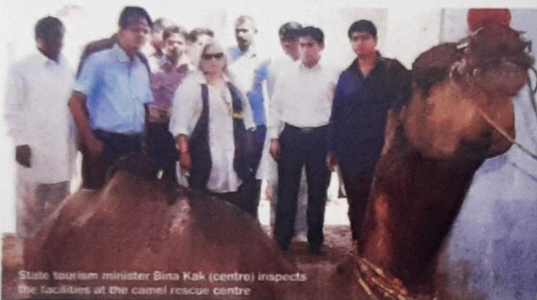
State tourism minister Bina Kak (centre) inspects the facilities at the camel rescue centre

It is in this end that city-based charitable trust Help In Suffering has come up with a camel rescue centre in Bassi on