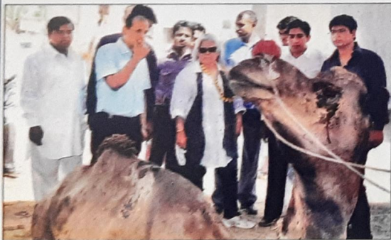
Tourism minister Bina Kak opens Help In Suffering's Camel Rescue Centre in Bassi on Sunday.